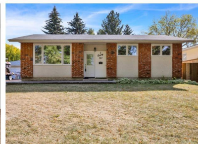
21 FERNWOOD CRES