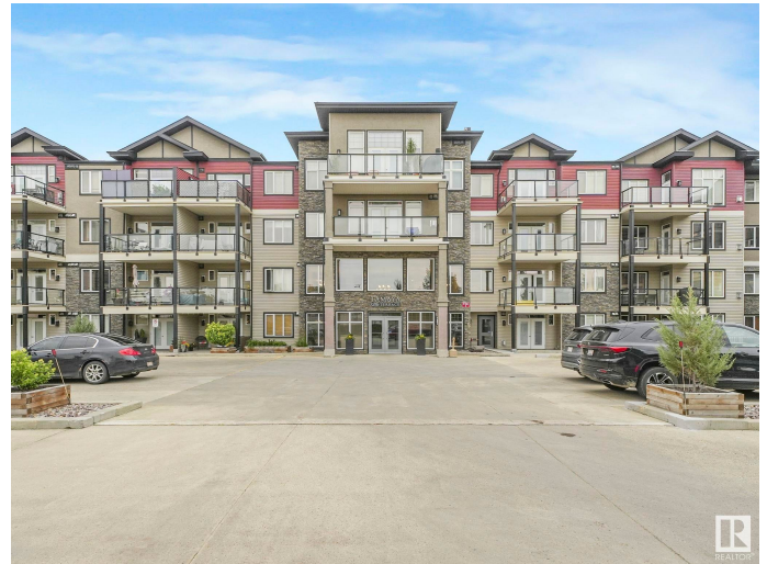
312-12408 15 Ave SW, Edmonton, AB

MLS® # E4449638 Price $274,900 Bedrooms 2 Bathrooms 2.00