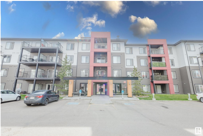
108-340 Windermere Rd NW, Edmonton, AB