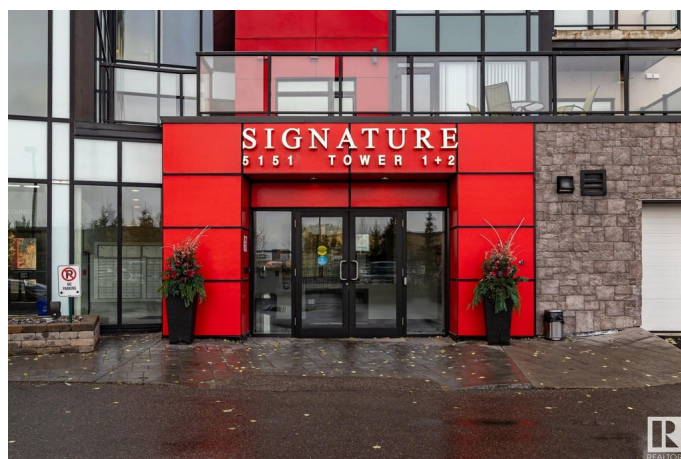
516-5151 Windermere Blvd, Edmonton, AB