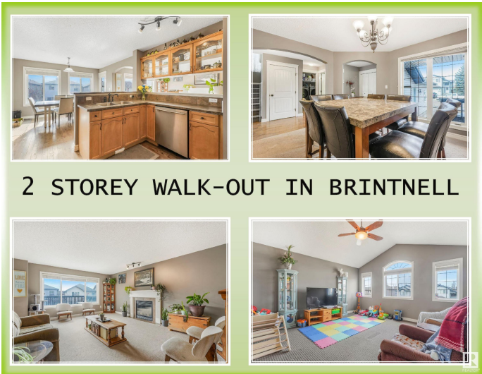
2 STOREY WALK-OUT IN BRINTNELL

3,178 Sq. Ft. of Finished Living Space in Brintnell – WALKOUT BASEMENT & PRIME LOCATION! This 2 story home features 3+1 bedrooms, 3.5 baths, and is just 1/2 block from the park. Offering a fantastic blend of space, functionality, and convenience. The main floor comprises a large living room with a cozy gas fireplace, and a kitchen filled with cabinetry, corner pantry, and eating bar – perfect for entertaining. A formal dining room provides flexibility and can easily function as an office or den. Upstairs, enjoy an oversized bonus room, a primary bedroom with walk-in closet and ensuite bath with corner soaker tub. Two additional bedrooms and full bath complete this level. The walkout basement with its separate entrance, living area, 4th bedroom & full bath - could be perfect for multi-generational living! This expansive home offers plenty of room to grow. Most recent improvements: sump pump (Apr. 2025) + furnace motor & circuit board in 2024.